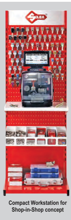
Compact Workstation for Shop-in-Shop concept

* Business generation considering 50% Flat keys, 30% Dimple / Laser Keys & 20% Transponder Keys / Remotes on average monthly basis.